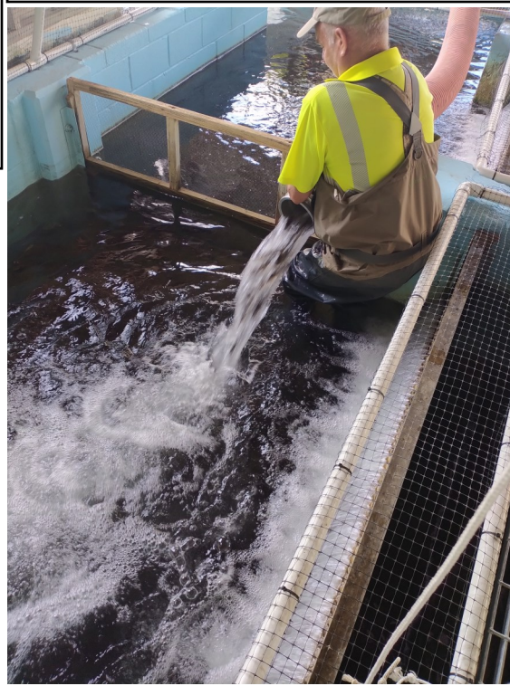
Above picture: Receiving some of the 18,000 Brown fingerlings at the nursery on July 13, 2022.